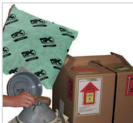
Protection of fragile liquids during transport.